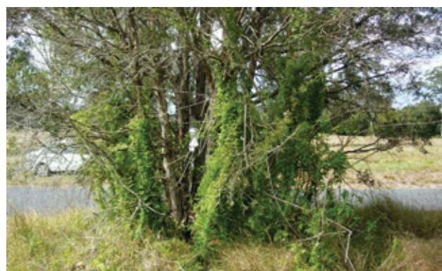
Bridal creeper 'columns' climb a native tree

Bridal creeper prefers to climb, and is often seen scrambling over other plants, along fence lines and under bird roosting sites such as tall trees.